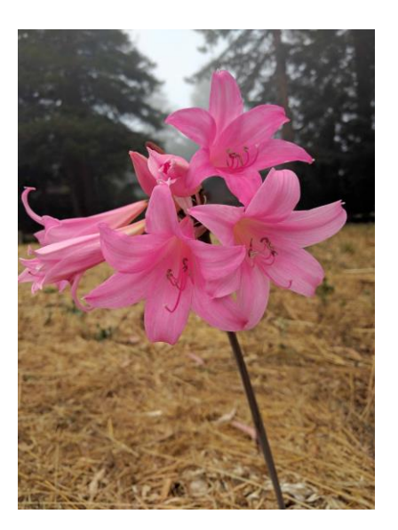
Naked Ladies in Bloom in Tilden S. Robey